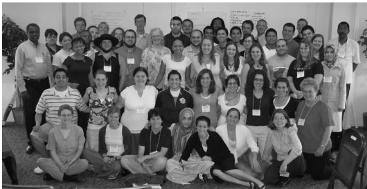
2006 Summer Interns and Mentors

For more information, download the application at www.iwj.org or contact (773) 728-8400, summerinternships@iwj.org .