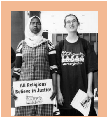
IWJ student interns stand in solidarity with striking workers.